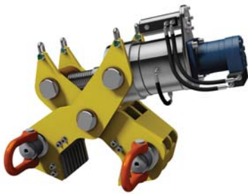
Cable Gripper CRT200HS