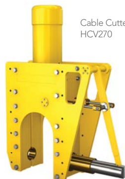
Cable Cutter HCV270

The cable cutting tools range from the light weight HCV100 for cables and umbilicals up to 4" (101mm) to the HCV270 for cutting up to 10.6" (270mm). The cutters are designed to operate in severe working conditions and allow diverless deployment.