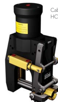
Cable cutter HCV100